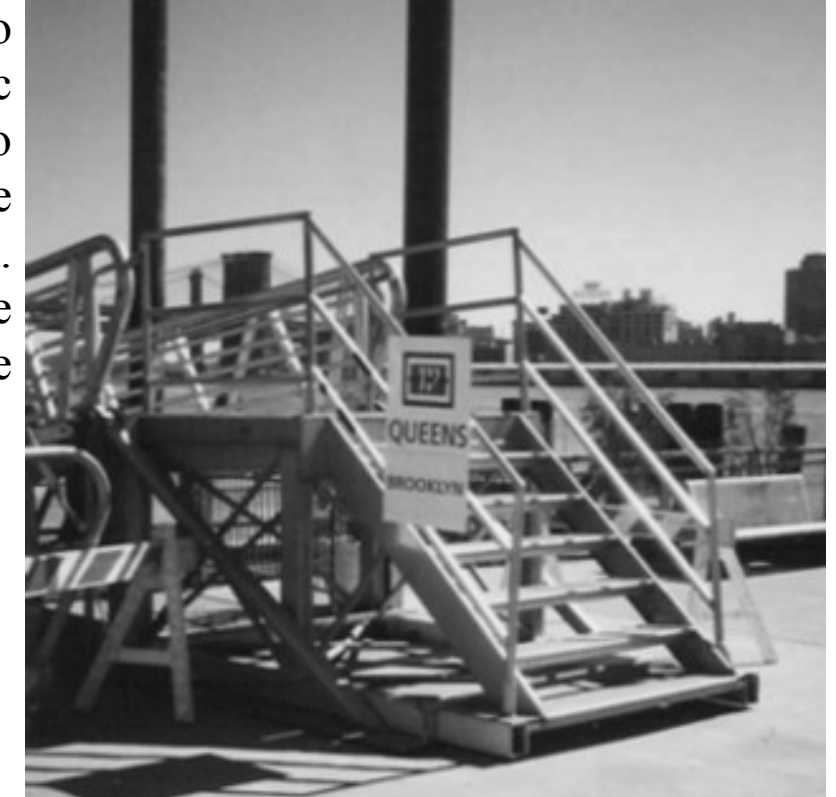
Steps to the Brooklyn and Queens Ferries

September 12, 2002 on Pier 11 to announce her plan to introduce a local law. This legislation sets specific guidelines and accessibility standards in relation to mandating accessible piers, docks, ferry and waterborne transportation services for people with disabilities. Barrier-free ferry services will benefit members of the public of all ages, particularly seniors who often have mobility or other disabling impairments.