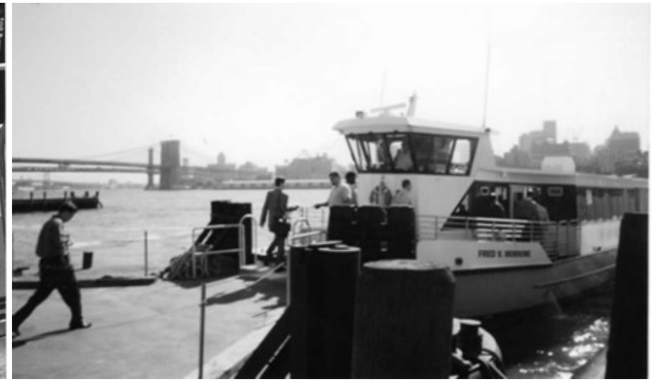
Man walking up 2 steps into ferry

This legislation sets specific guidelines and accessibility standards in relation to mandating accessible piers, docks, ferry and waterborne transportation services for people with disabilities. Barrier-free ferry services will benefit members of the public of all ages, particularly seniors who often have mobility or other disabling impairments.