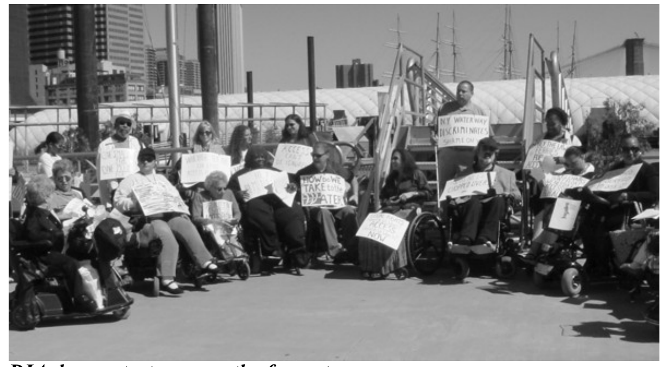
DIA demonstrators near the ferry steps