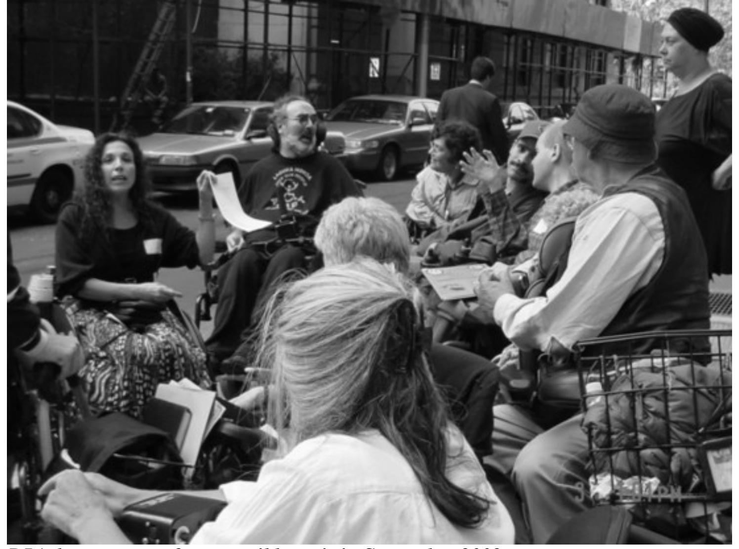
DIA demonstrates for accessible taxis in September 2002